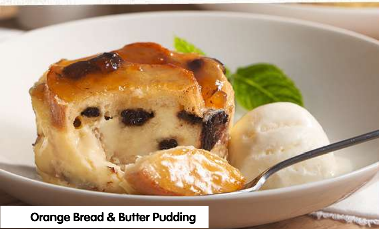
Orange Bread & Butter Pudding