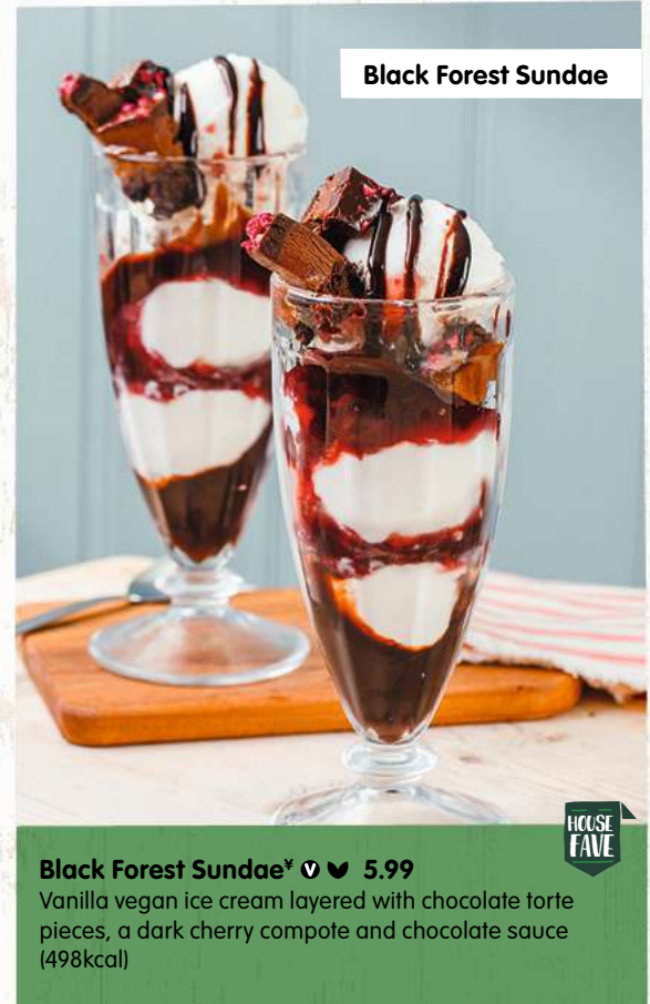
Black Forest Sundae

Served with your choice of a hot drink. (205kcal calories stated do not include hot drink)