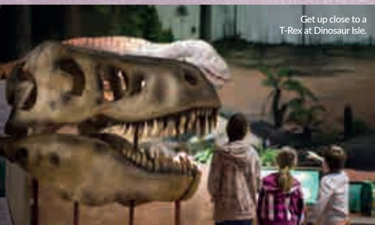
Get up close to a T-Rex at Dinosaur Isle.

Hidden from view behind the hills is the county town of Newport with lots of eateries including a dedicated café for young ones – Bebeccino. You'll also find Carisbrooke Castle, Monkey Haven and Robin Hill Country Park; filled with things to see, do and climb!