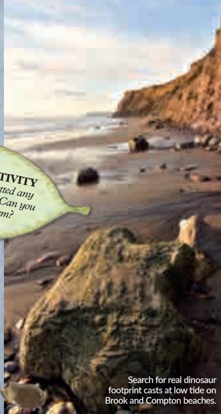
Search for real dinosaur footprint casts at low tide on Brook and Compton beaches.

FIELD ACTIVITY Have you spotted any animal prints? Can you identify them?