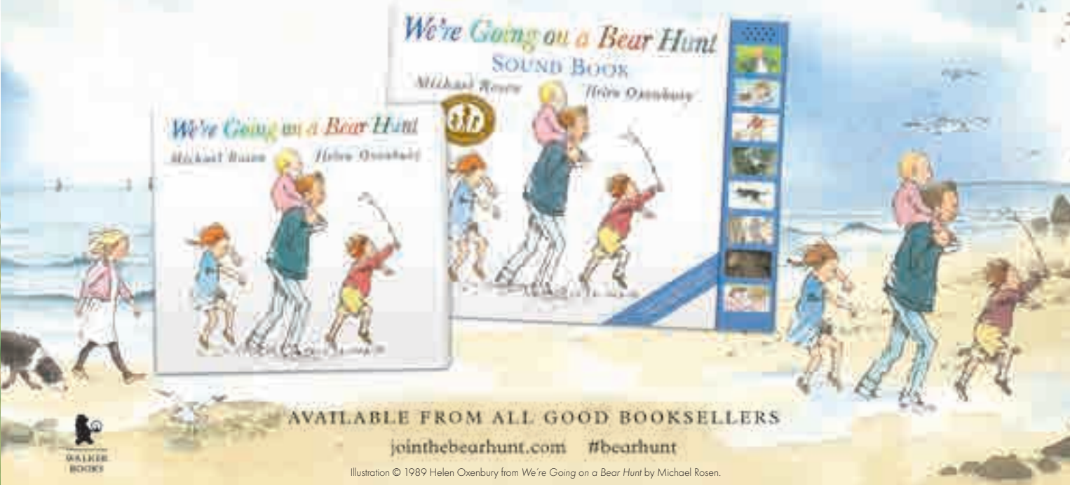
Illustration © 1989 Helen Oxenbury from We're Going on a Bear Hunt by Michael Rosen.