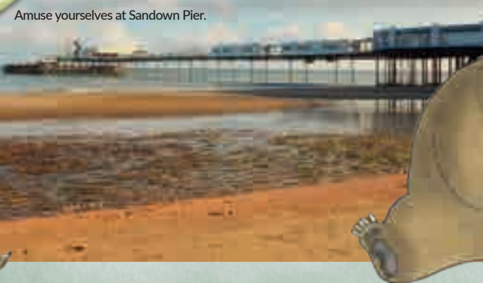
Amuse yourselves at Sandown Pier.