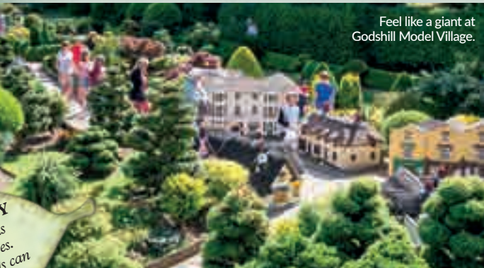
Feel like a giant at Godhill Model Village.

To find out, visit: www.nationaltrust.org.uk/isleofwight