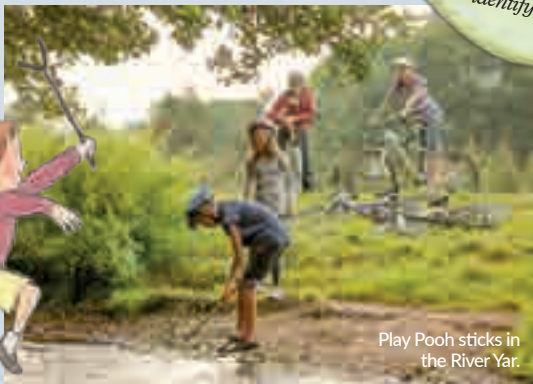
Play Pooh sticks in the River Yar.