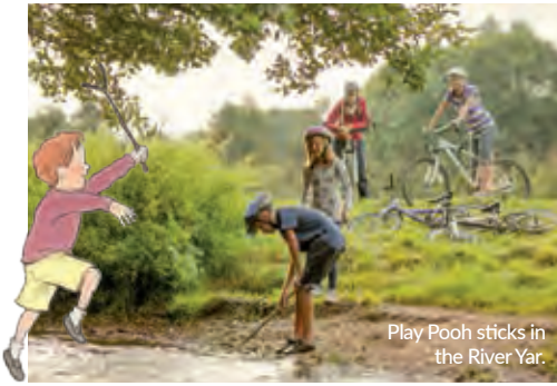
Play Pooh sticks in the River Yar.