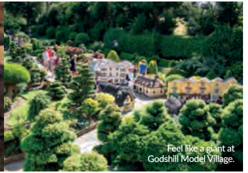
Feel like a giant at Godshill Model Village.