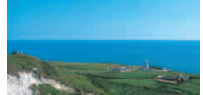
St Catherine's Lighthouse