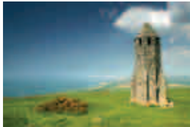
The Pepper Pot, Niton Down

Starting at Grange Chine this walk ambles over cliffs tops giving superb views of the crumbling coastline. The chines are a special coastal feature of this particular area. As you meander along the cliff top route it is easy to imagine the smuggling trade of old going on along this relatively remote stretch of coast.