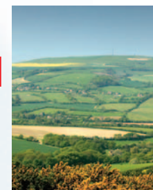
View from Stenbury Down