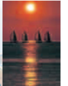
Sunset at Cowes