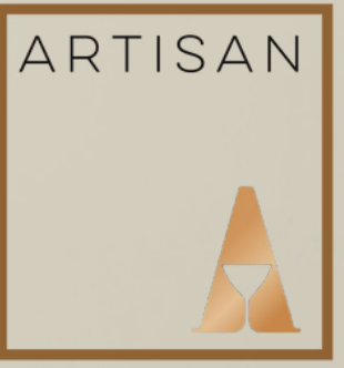
COCKTAIL BAR & GRILL